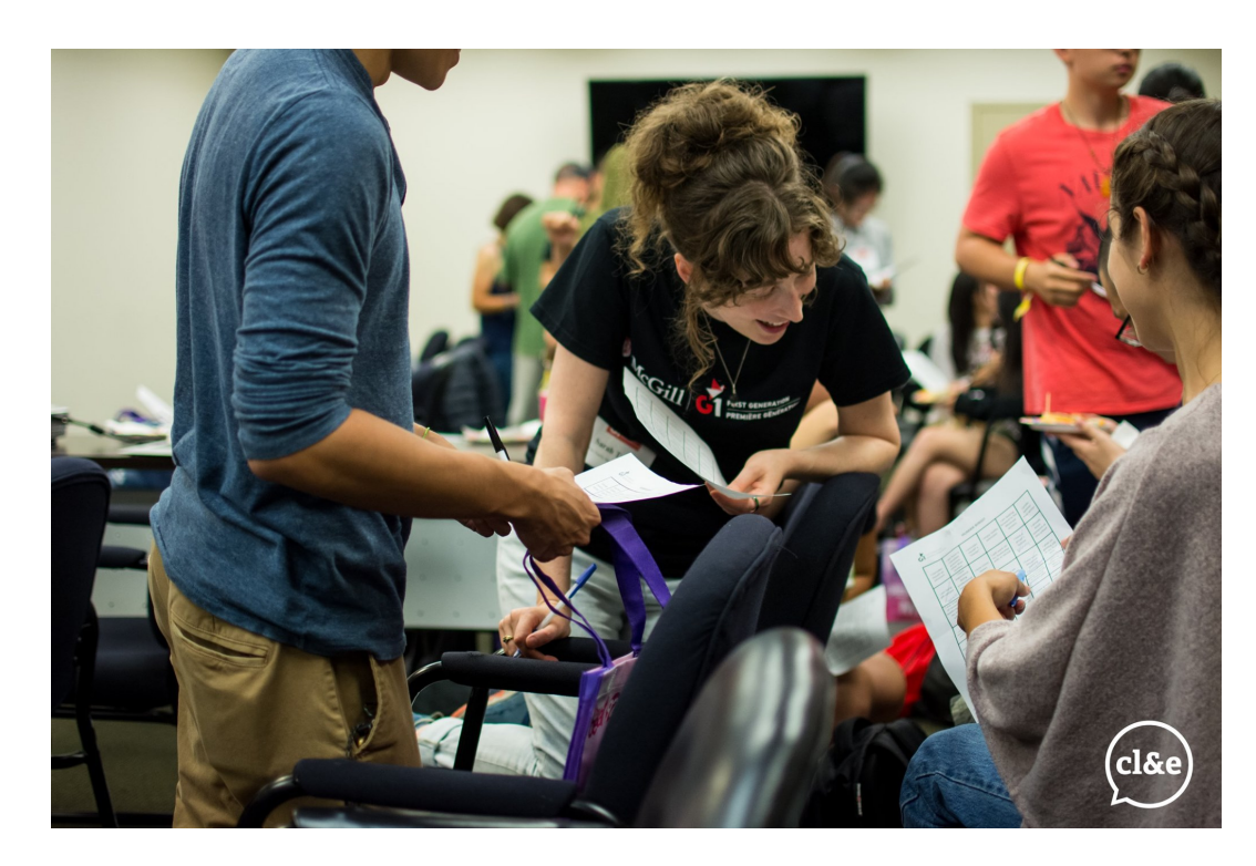
First-Generation Orientation 2019

1st Up is McGill's official First-Generation Peer Support Group - solely dedicated to the needs of First-Gen students. The group runs peer drop-in sessions, monthly support meetings on a variety of topics (finances, self-care, job-hunting), and networking events. You can keep up to date on events via the group's (private) <u>Facebook page</u> or on the <u>First Generation</u> <u>website</u>.